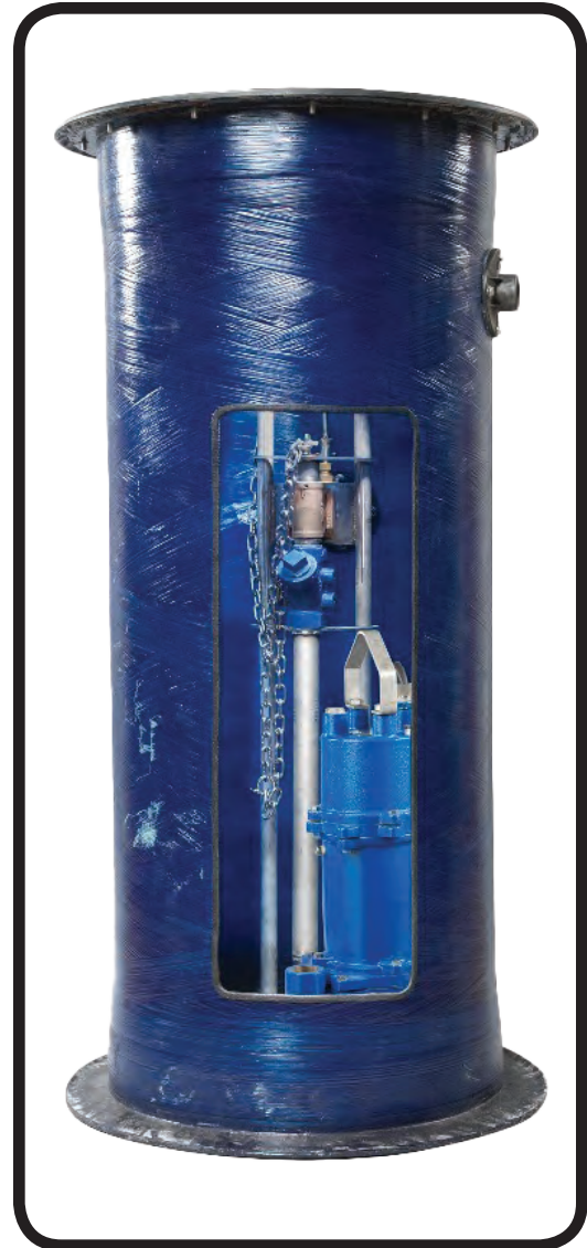
Simplex Grinder Package 24" Dia. Various Depths 1-1/4" Discharge For 2Hp Grinder Pumps

Other sizes and configurations available by quote only.